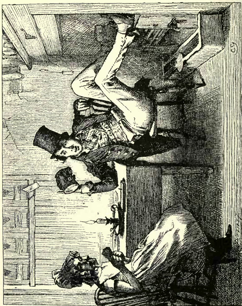
"THEN MARCHIONESS," SAID MR. SWIVELLER, "FIRE AWAY!"